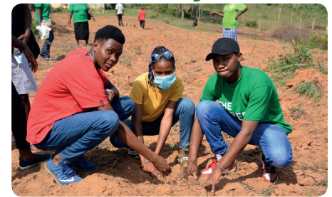
Pwani University Students participate in tree planting

REREC organized a tree planting exercise for 10,000 tree seedlings at Pwani University farm through a collaborative effort between the Corporation, Kenya Forestry Research Institute (KEFRI) and the University. The event, which was held on Thursday 20 th May, 2021 at the University was attended by County Government officials, the Kenya Forest Service (KFS) and National Environment Management Authority (NEMA), among others.