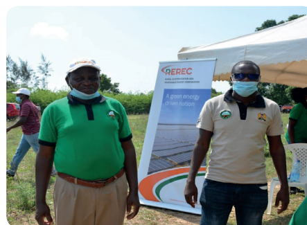
Staff from KEFRI during the tree planting exercise

REREC provided over Ksh. 350,000 to assist in upgrading KEFRI'S nursery facilities at Gede and enhance its capacity to raise materials for the tree planting program in the area.